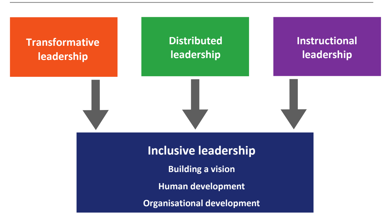
Figure 2. Inclusive leadership

Figure 2 shows how the leadership models can influence and support the core functions of inclusive school leaders. Transformative leadership is valuable for building a vision and setting an inclusive direction. Distributed leadership is important for sharing leadership to support both human and organisational development. Instructional leadership affects human and organisational development towards inclusive education. When these three leadership models co-exist in an integrated practice, there is a substantial impact on learner achievement, pedagogical quality and the development of professional learning communities in schools (OECD, 2016).