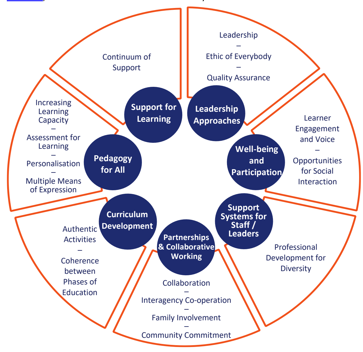
Figure 2. Links between the RA self-review and the Ecosystem model structures and processes